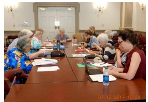
Advocacy Corps meeting

One of our top priorities this past year has been reform of bail practices that contribute to excessive incarceration, particularly affecting low income and minority persons. That bill (HB 204) was finally approved by the Senate on January 16 and signed by the Governor on January 24.